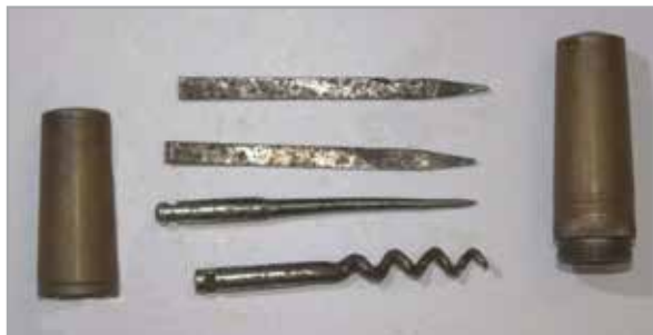
This small toolkit was issued to British soldiers between 1914 -18 and is part of the collection of authentic WWI artefacts held at Whitworth Museum.