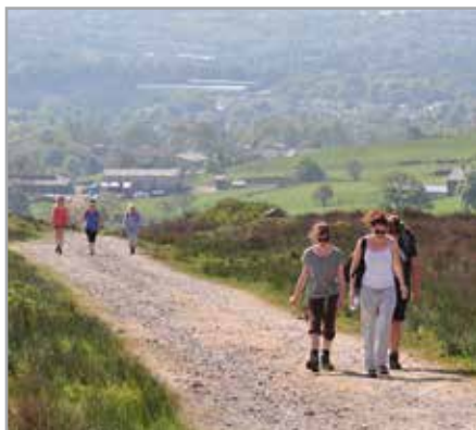
Participants in the 2014 Skyline Walk.

May's inaugural Skyline walk was also blessed with perfect walking weather, and 330 people, most from Whitworth but with a good sprinkling from further afield, signed up. Of those, over 270 of all ages completed the whole moorland circle, finishing at varying speeds and in varying degrees of disrepair at Lobden Golf Club, where a welcome meal awaited all. The number of walkers allowed the organisers to make contributions to the Tourism and Leisure Committee, the Sports Council and the Mayor's Charity Fund. Thanks to the Countryside Rangers and all volunteer marshalls, without whose goodwill the event could never have taken place. Next year's event has been scheduled for Sunday 17 May.