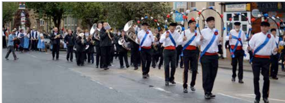
The Band accompanying the Whitworth Morris Men at the 2012 Rushcart; see them again this year on 7 September!