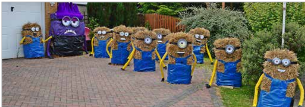
General category winner 'Minion Madness' on Cottesmore Close.

The General Category winners received a family ticket to see 'Alice In Wonderland' at the Octagon Theatre in Bolton, and all winners and runners up received a certificate. The 2015 Scarecrow Festival will take place from 27 June – 5 July and the Committee encourages as many people and organisations as possible to take part.