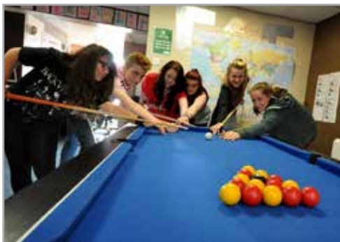
The Treacle Challenge, and 515-ers enjoy a game of pool.