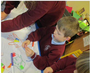
Leo helping to make the Eucharist table cloth

There were different stations set up as part of the Churches Together "Messy Church" initiative.