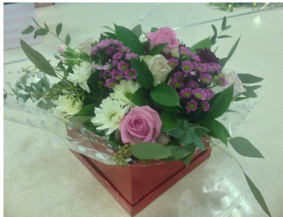
Just one of the many stunning arrangements which have been made at the flower arranging group

The U3A celebrate their first year in June and have seen a steady growth in special interest groups, outings and members. There are new groups setting up all the time – from learning foreign languages to table tennis! - so they suggest you check the website or Facebook page to find out more.