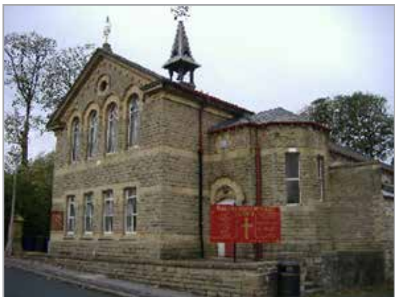
Hallfold United Reformed Church

Hallfold United Reformed Church on Hall Street is coming to the end of its programme of social and religious events for 2014 but there are, nevertheless, several more seasonal events taking place during late November and December. On Saturday 29 November, the annual Christmas Tree Festival will take place between 10am and 2pm, during which many organisations connected with Hallfold will each be displaying a themed Christmas tree. Tuesday 2 December at 7.30pm is the popular Candlelight Service which will be followed by mince pies, sherry and tea/coffee. The Brownies and Rainbows hold their Christingle Service on Monday 8 December at 6.30pm. Other services over the festive period include: Lessons and Carols at 10.45am on Sunday 14 December, Junior Church Christmas Festival at 10.45am on Sunday 21 December, Christmas Eve Service at 11.30pm and Christmas Day worship at 10.30am. Everyone is invited to all of these events and to the morning services at 10.45am each Sunday throughout the year - a warm welcome is assured. As in previous years, Hallfold intends to hold another busy programme of events for 2015. Please check future editions of this magazine and public notice boards for details of forthcoming social functions.