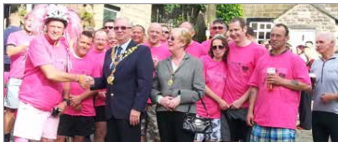
The Mayor and Mayoress congratulate the riders