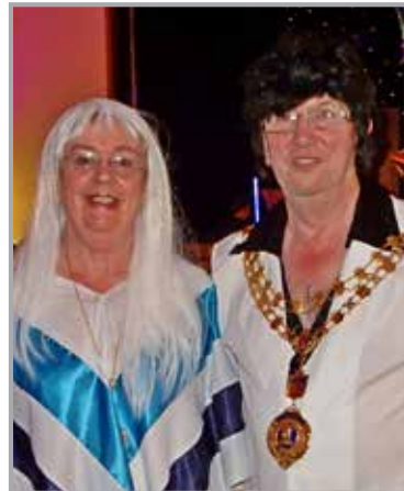
The Mayor and Mayoress at One Night of Abba