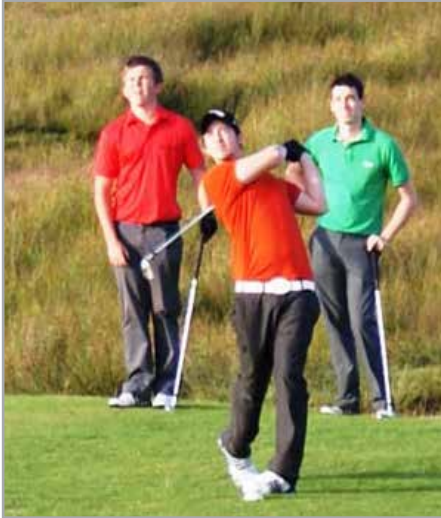
Young golfers at Lobden